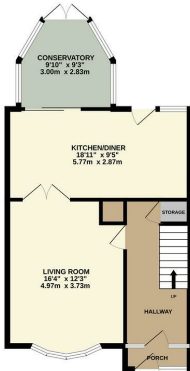
GROUND FLOOR 568 sq.ft. (52.7 sq.m.) approx.